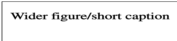
Figure 3. Figure with short caption (caption centred).

6.6.1. Examples. The following examples show how to format a number of different figure/caption combinations. Note that the table borders are shown as broken lines for guidance only.